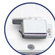
Extension power switch