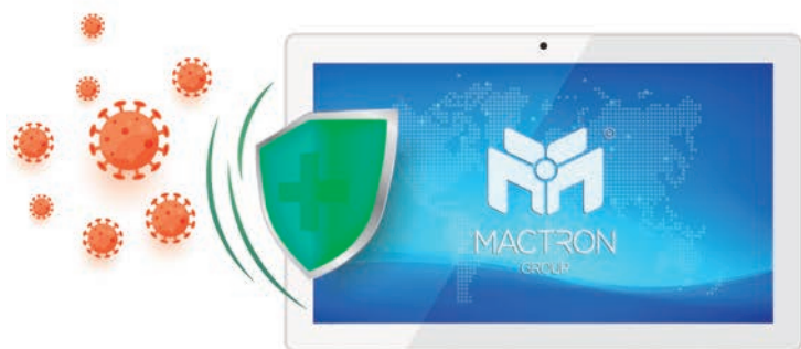
Medical Grade Anti-Bacterial Coating