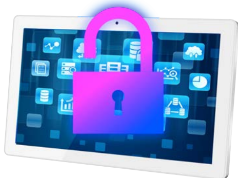
Support TPM & vPro