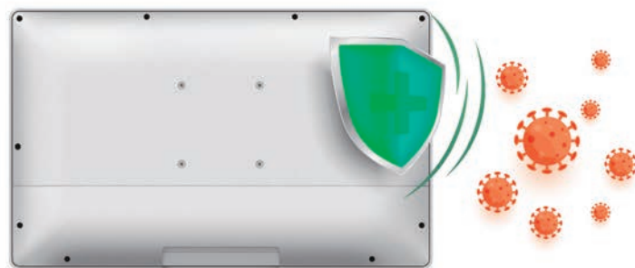
Aluminum Die Casting Housing